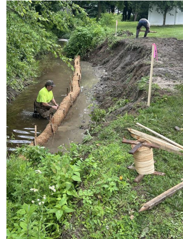
this project. (Continued on Page 2).

Work was completed on Monday, June 23. Thank you to all the surrounding and adjacent homeowners for your patience during the scheduling and execution of